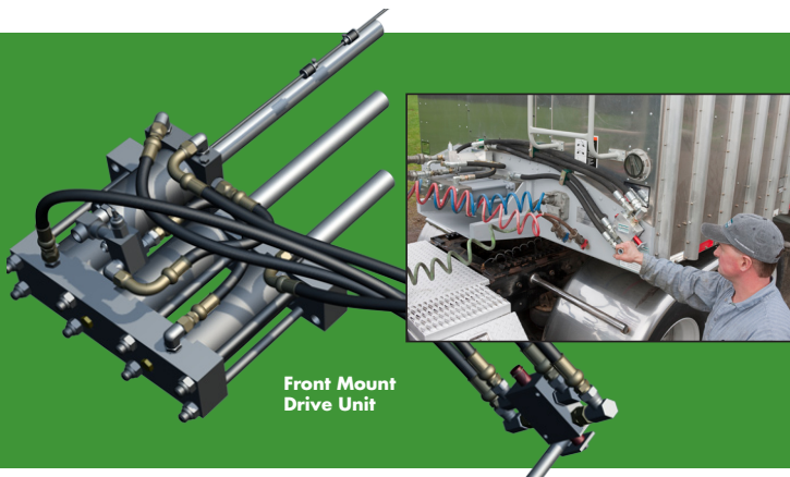
Front Mount Drive Unit